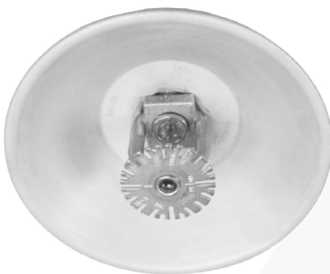
Pendent with shield

The F1FR-FS56 and F1FR-FS42 Flat Spray Sprinklers temperature rating are identified by the color of the glass bulb capsule.