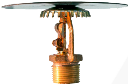
Upright with Factory Installed Shield (Factory installed water shield)

Reliable Model GXLO (extra-large orifice) upright and pendent sprinklers are standard coverage standard-response sprinklers that utilize a robust center strut, solder in compression thermal element. These sprinklers are intended for use in hydraulically calculated control mode density area (CMDA) storage and non-storage occupancies in accordance with the area/density curves of NFPA 13 or other applicable standards.