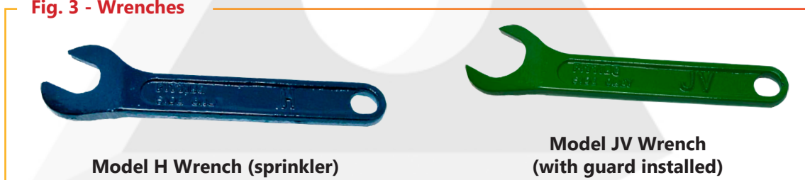
Fig. 3 - Wrenches

Failure to properly maintain sprinklers may result in inadvertent operation or non-operation during a fire event.