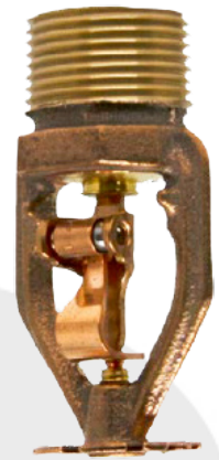
Fig. 2 - Model GXLO Pendent Components and Dimensions